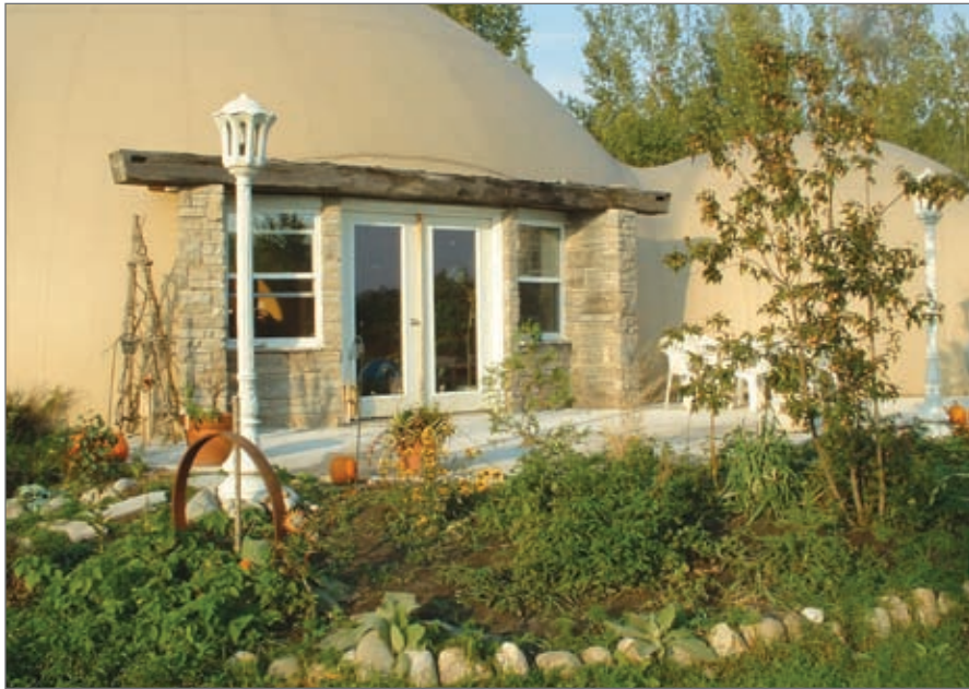
This is the same home featured in the top photo on p. 33. It was built by The Great Lakes Dome Company.

that the round floor plan and sloping walls are space inefficient, proponents of domes argue that they are actually more efficient than traditional homes because they have much less hall space. Domes also lack attics, which can act as solar collectors.